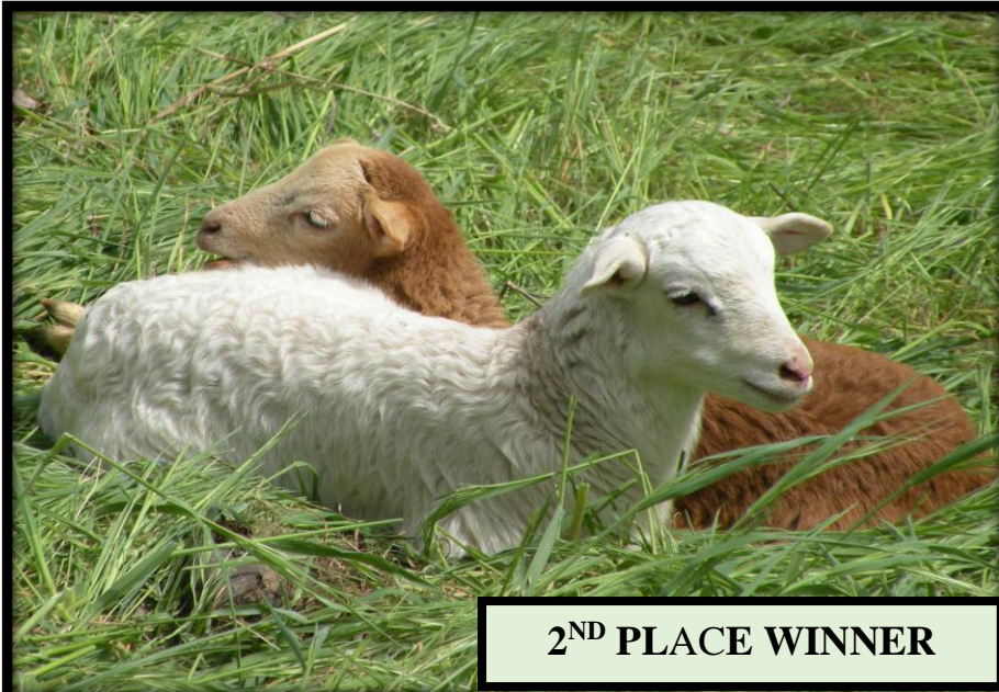
2 ND PLACE WINNER