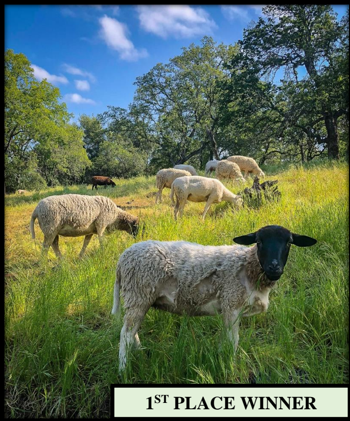
1 ST PLACE WINNER