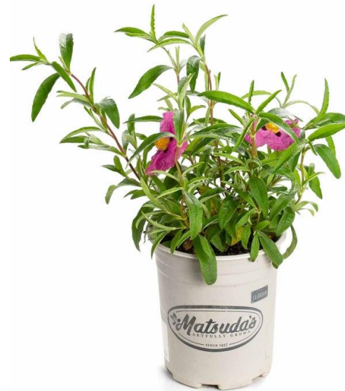
Cistus Orchid RockRose