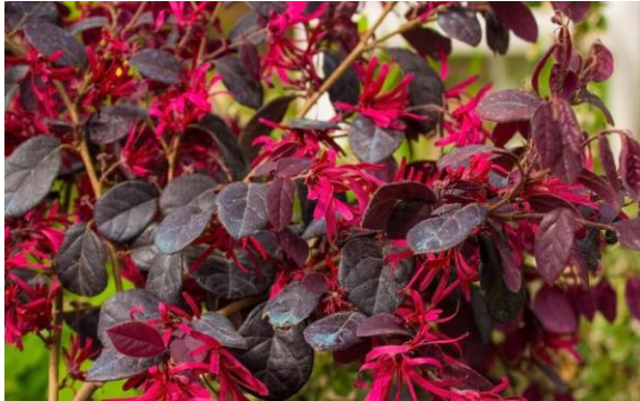
Loropetalum 'Purple Majesty'